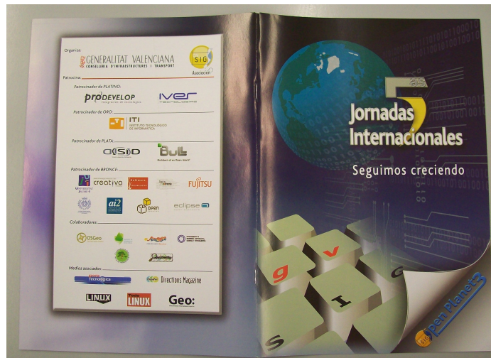
Picture 5. 5th gvSIG Conference. Open Planet Magazine.