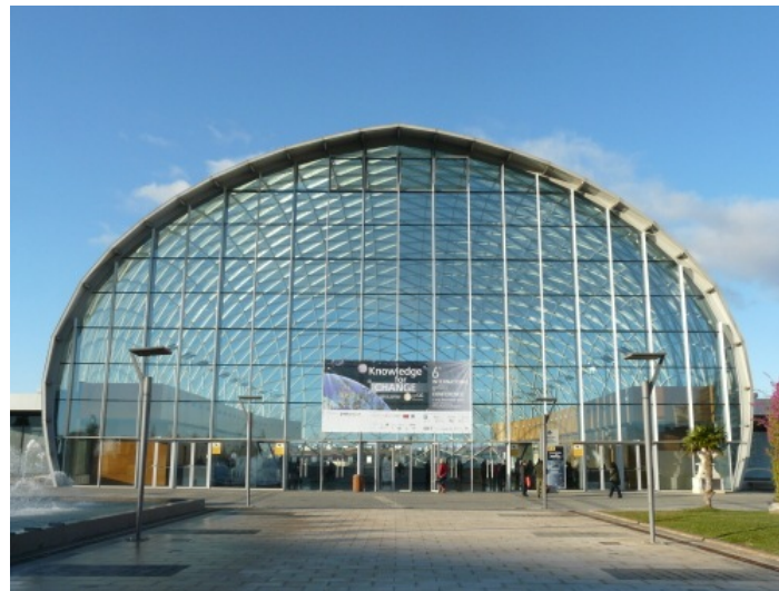
Picture 1. Main poster on the entrance to the Exhibition Centre of Feria Valencia at the 6th gvSIG Conference.