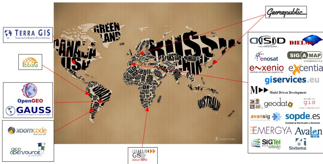
Graphic 2. gvSIG Association collaborators