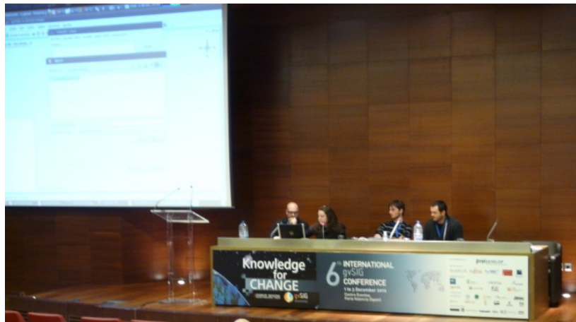
Picture 3b. 6th gvSIG Conference. Example of the under-table on the main table in the hall.