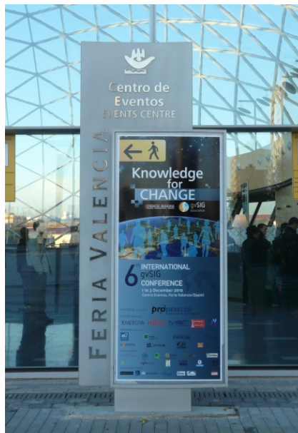
Picture 3a. 6th gvSIG Conference. Example of the cartel placed on the Exhibition Centre of Feria Valencia.