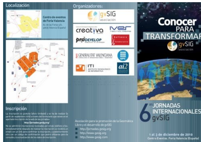
Picture 2b. 6th gvSIG Conference. Detail of the leaflet design.