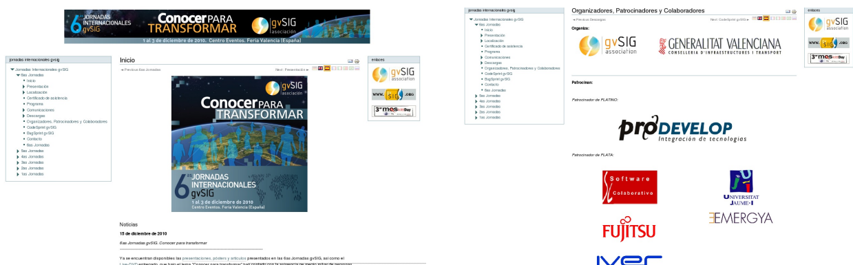
Picture 4. 6th gvSIG Conference. Detail of the web page design.