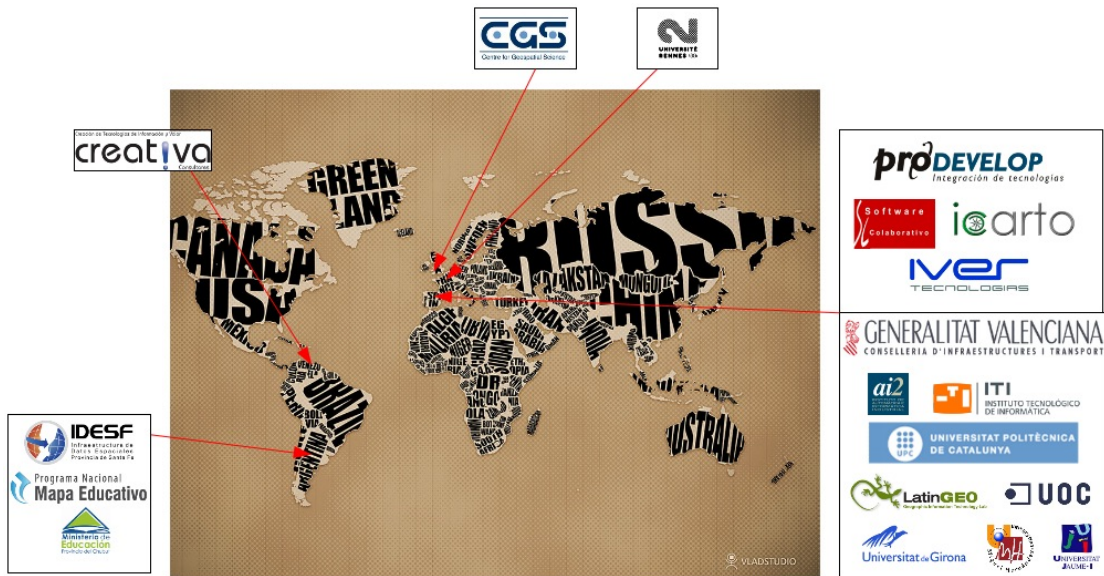
Graphic 1. gvSIG Association members