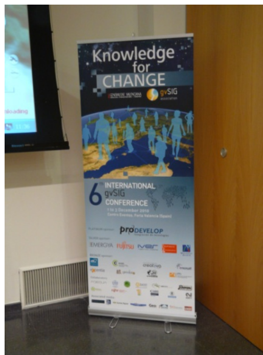
Picture 2a. Example of information poster (Roll-Up) that will be placed at the different events.