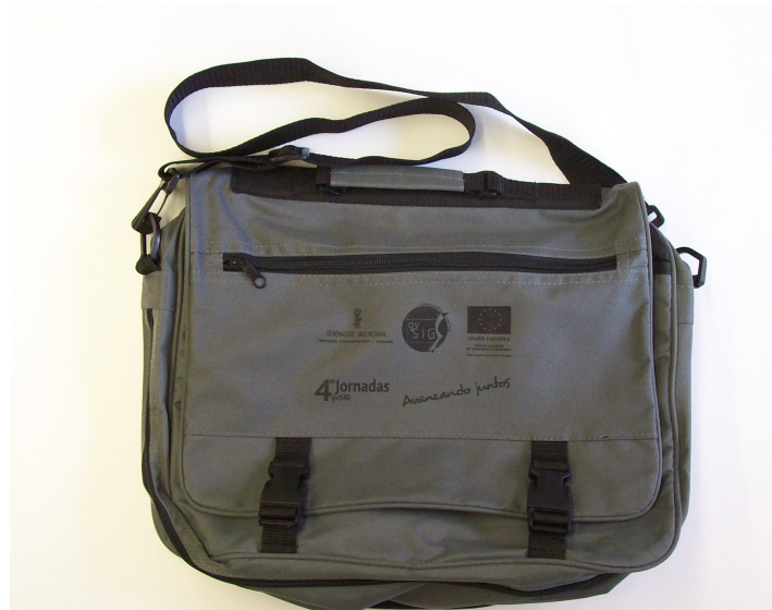
Picture 4. Bag with the official documentation given to registered people.