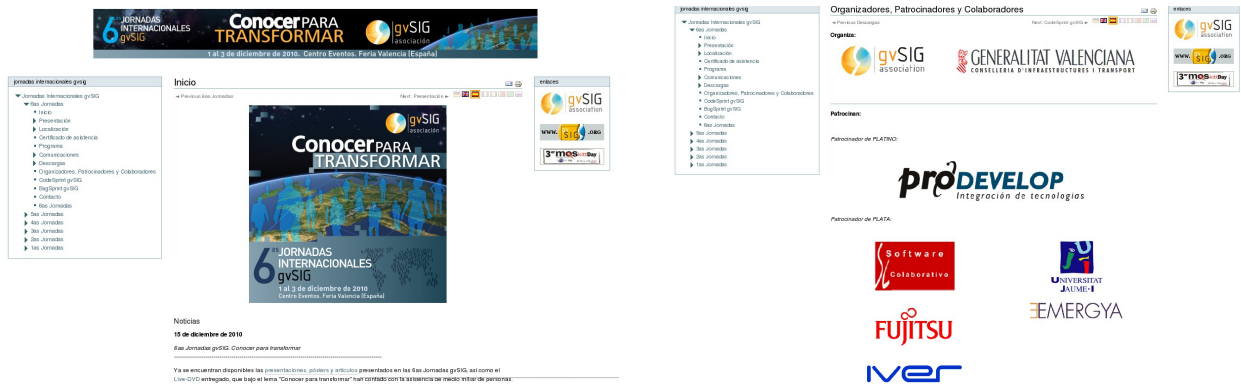
Picture 3. Detail of the web page design.