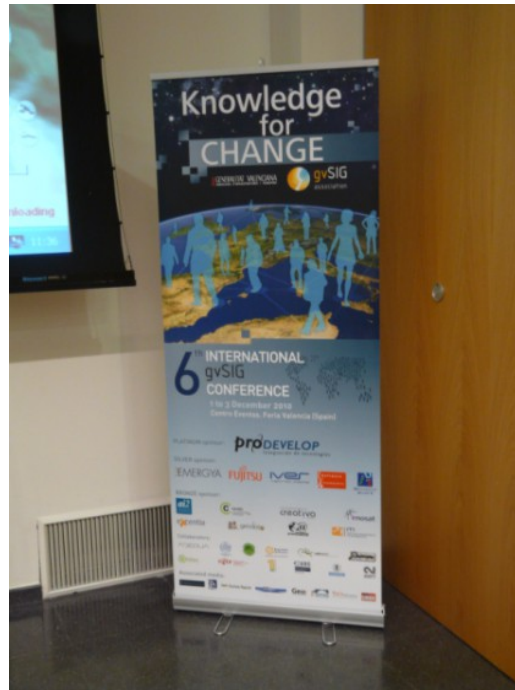
Picture 2a. Example of information poster (Roll-Up) that will be placed at the different events.