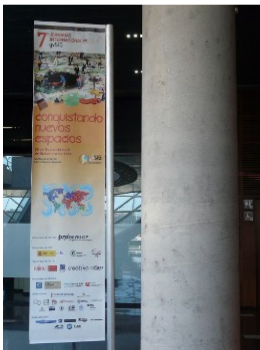
Picture 1. Example of a cartel placed on the Exhibition Centre.