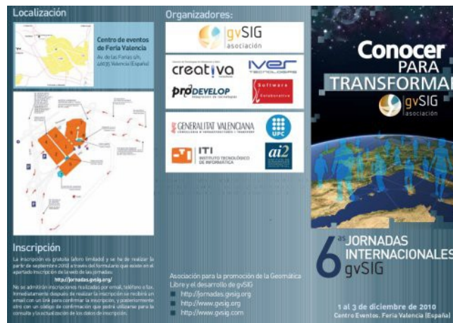
Picture 2b. Detail of the leaflet design.