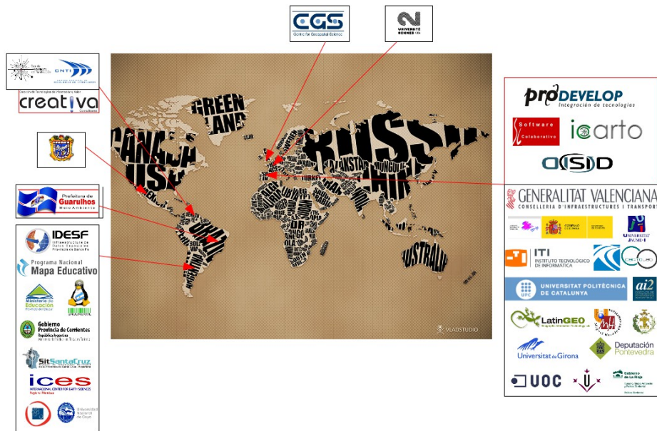
Graphic 1. gvSIG Association members