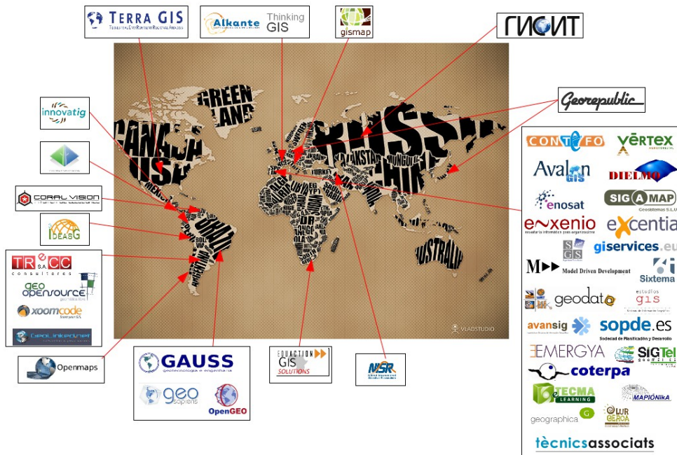
Graphic 2. gvSIG Association collaborators